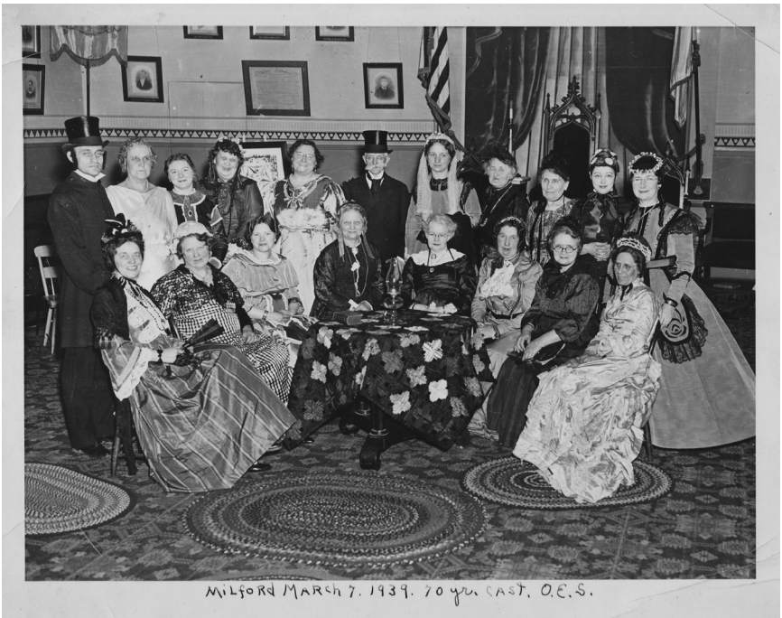
MILFORD MARCH 7, 1939. 70 yrs. CAST, O.E.S.

Bay State Chapter consolidated with Palestine Chapter No. 114 in 1980.