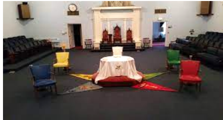
View of a Chapter Room

To apply for membership call the Grand Chapter Office number above. For more information, visit our website at https://massoesnews.com