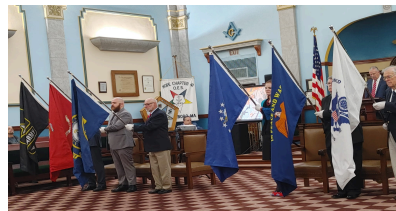
"Honoring Our Veterans" Ceremony Hope Chapter, No. 41 Attleboro, MA

Revised and Reprinted 2024 by the Membership Committee of the Grand Chapter of Massachusetts Order of the Eastern Star Thanks to all who contributed photos and content