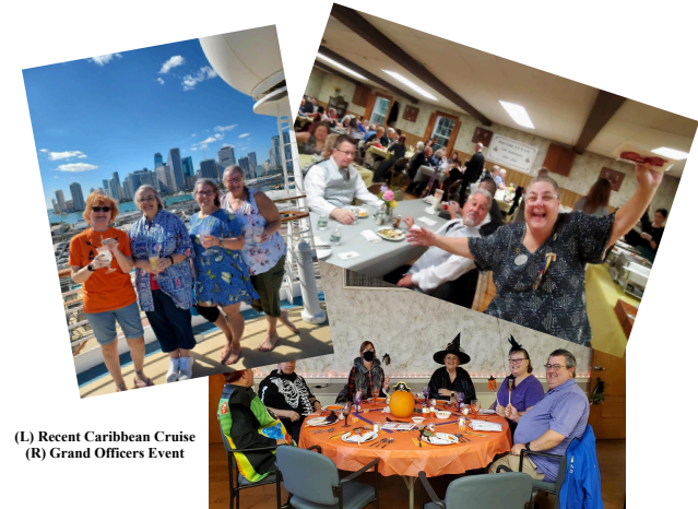
(L) Recent Caribbean Cruise (R) Grand Officers Event

Something for all interests and abilities.