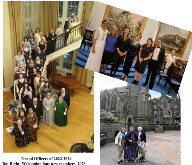
Grand Officers of 2023-2024 Top Right: Welcoming four new members-2023

As the largest world-wide fraternity for both women and men, you will find that wherever you travel, you can always find a local chapter... YOU ARE NEVER ALONE! "Star" is a place where life-long friendships are made. As an active member in your local chapter, you will get to know many people throughout the State as well as other countries, thus forming great friendships to last a lifetime.